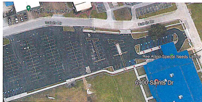
SITE MAP SCALE: N.T.S.