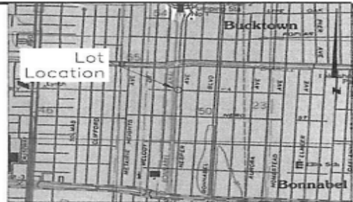
Vicinity Map Scale: N.T.S.