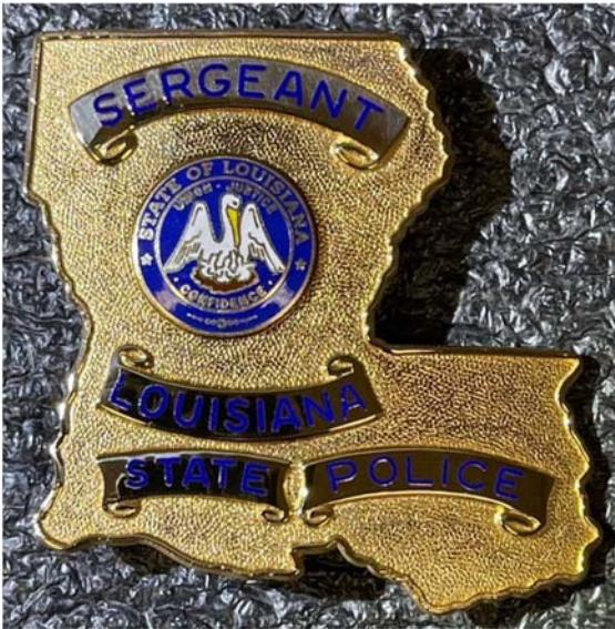
LSP Breast Badge, Front: