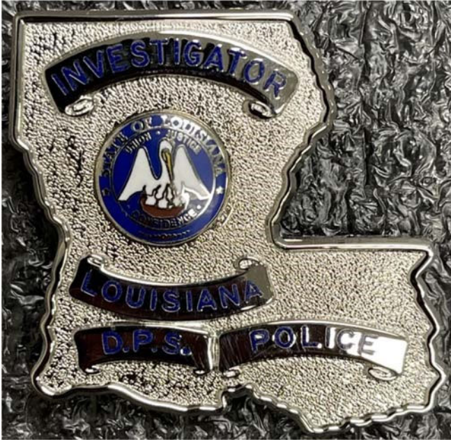
DPS Breast Badge, Front: