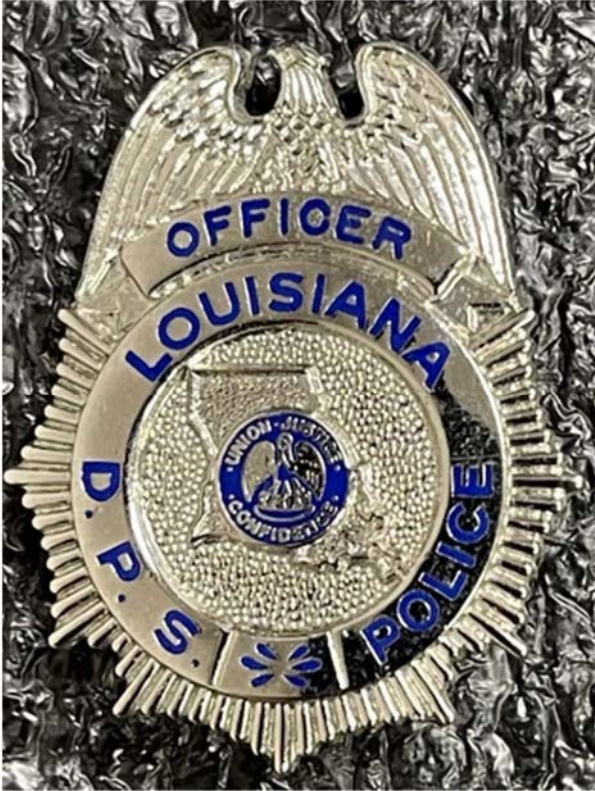
DPS Hat Badge, Front: