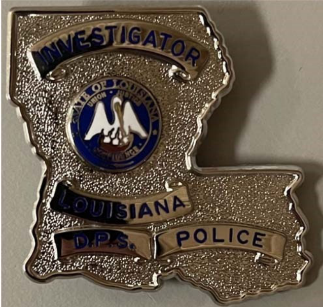
DPS Wallet Badge, Front: