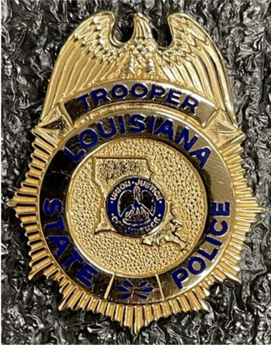
LSP Hat Badge, Front: