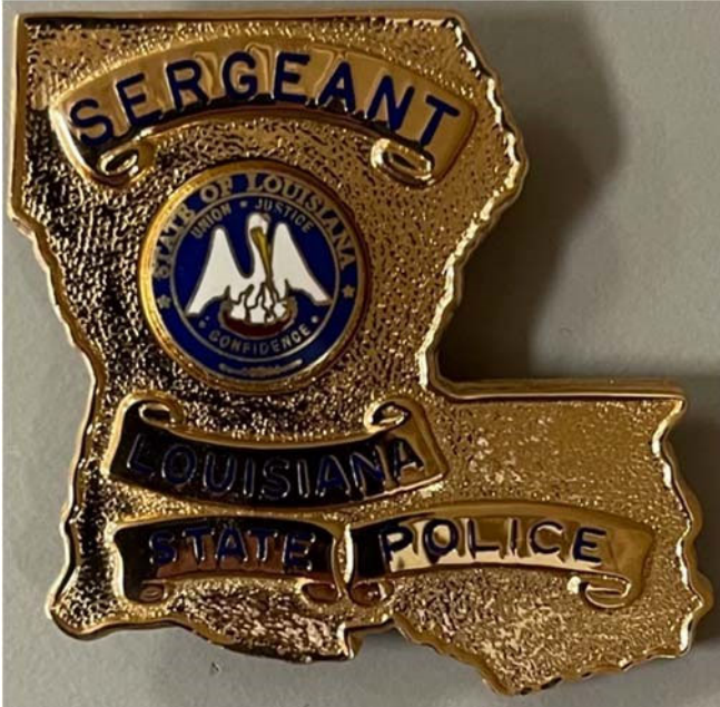
LSP Wallet Badge, Front: