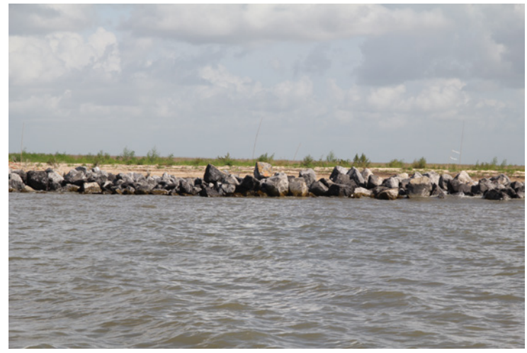
Shoreline protection being constructed along the Rockefeller Wildlife Refuge Gulf

This project is listed on Priority Project List 10.