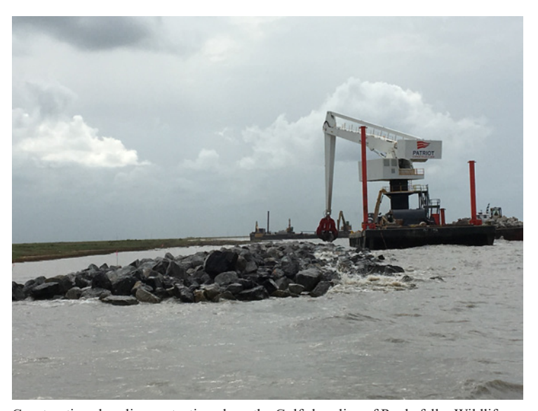
Constructing shoreline protection along the Gulf shoreline of Rockefeller Wildlife Refuge.